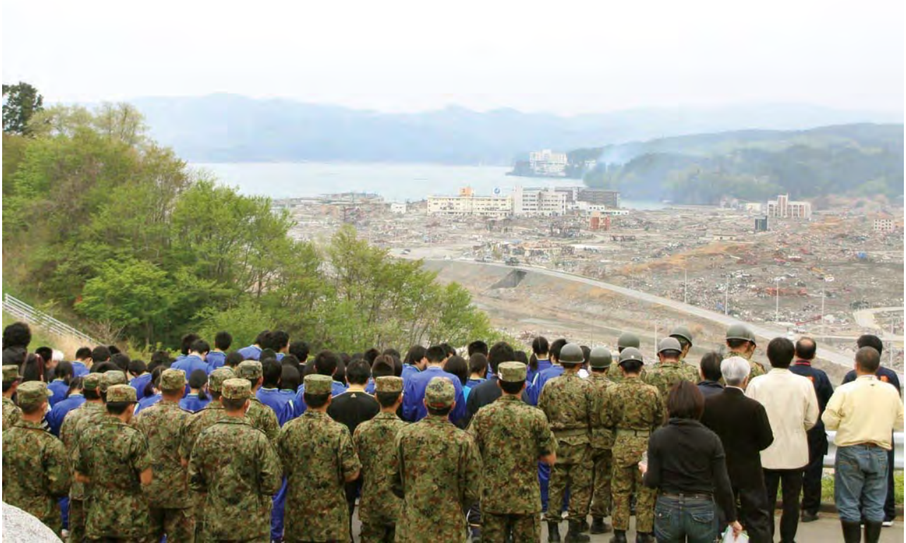
▲“Sending our thoughts to the coast of Minamisanriku” took place at Shizugawa Junior High School at the suggestion of an NPO involved in relief operations. At the gathering, together with students and residents, Self-Defense Forces personnel stood quietly facing the sea.