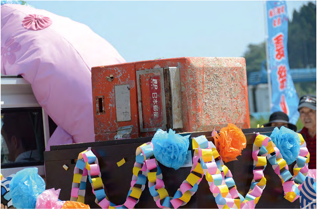
▲ A postbox that was washed away from Utatsu, Minamisanriku drifted out into the Pacific Ocean and was later returned to Utatsu with the support of Okinawan people.